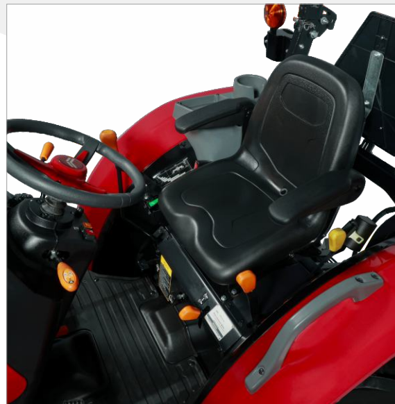
INNOVATIVE COMFORT & DESIGN.