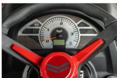
INFORMATIVE DISPLAY PANEL.